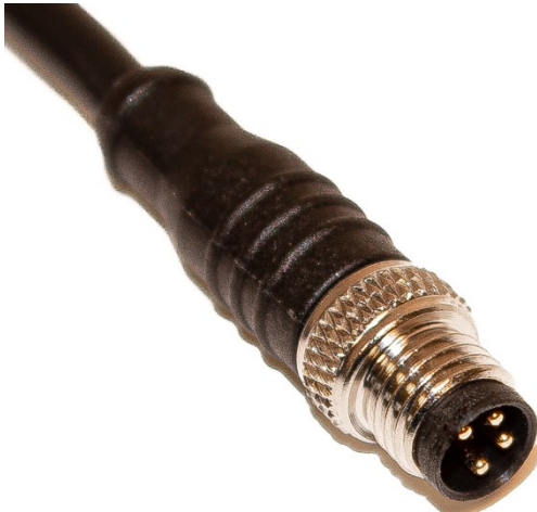
MALE FACE VIEW

(M8 Cordset, 4 Position, 24 AWG Unshielded PVC, Male Straight to Open End)