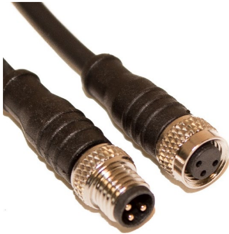
MALE FACE VIEW

(M8 Cordset, 3 Position, 24 AWG Unshielded PUR, Male Straight to Female Straight)