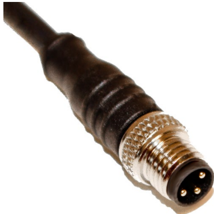
MALE FACE VIEW

(M8 Cordset, 3 Position, 24 AWG Shielded PUR, Male Straight to Open End)