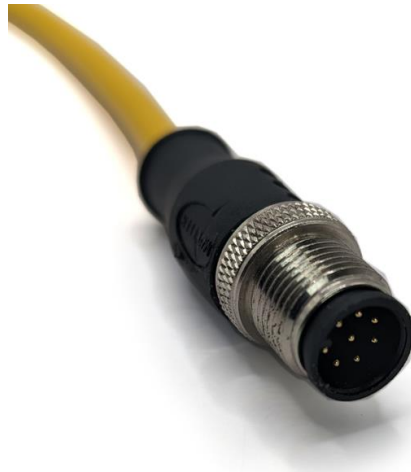
MALE FACE VIEW

(M12 Cordset, 8 Position, 24 AWG, Unshielded Male Straight to Free End)