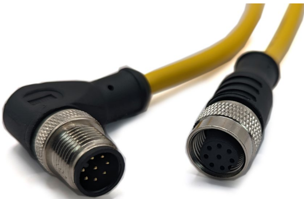
MALE FACE VIEW

(M12 Cordset, 8 Position, 24 AWG Shielded, Male Right Angle to Female Straight)