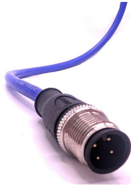
MALE FACE VIEW