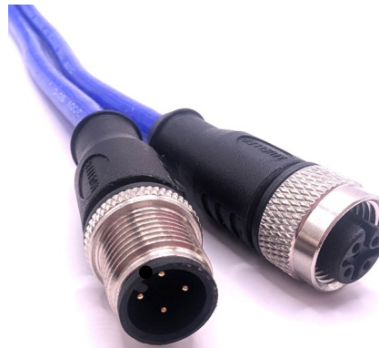
MALE FACE VIEW