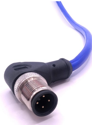
MALE FACE VIEW